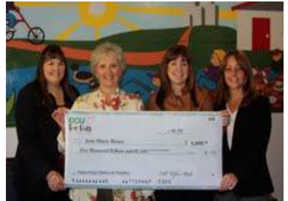
DCU for Kids, Digital Federal Credit Union's nonprofit charitable foundation, awarded AMH a $5,000 grant in July.

AMH would like to graciously thank DCU for Kids for their amazing contribution to our organization and for helping us end homelessness one family at a time!